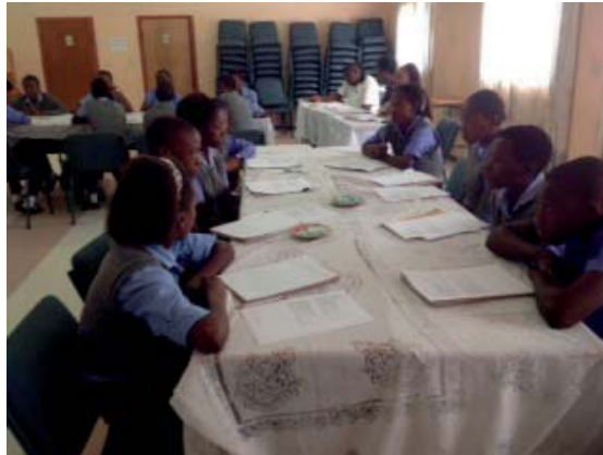
Figure 5. Training Workshop for Learners and Teachers at Onalulago Combined School.

munication skills in any learning environment. Teachers were also enlightened on good teaching methods to ensure participation that will provide learners with the means by which they can engage in processes of change that will bring about the realization of their rights, and prepare them for an active part in society and change.