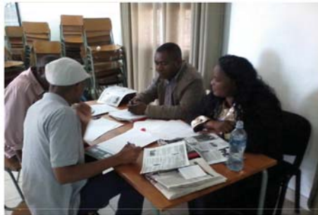
Grade 11 teachers in the workshop

This workshop was held on 10 th August 2013 and 22 teachers (8 women and 14 men) participated. The objective of the workshop was to raise teacher's awareness on CRC issues and the importance of building warm relationship and good communication with their students. In order to achieve this objective, a questionnaire and debates were used (see appendix 2- questionnaire for teachers). Teachers worked in small groups to discuss the questions and after that they had to present their ideas in front of the room. After presentations, a discussion about the ideas presented was held.