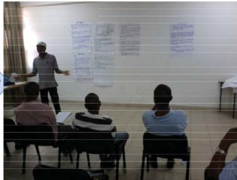
One of the teachers presenting the ideas of the group